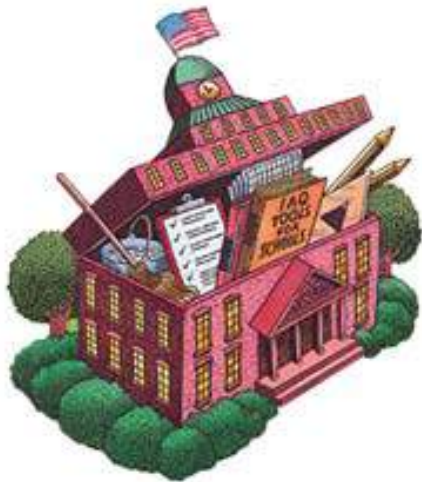
Proactive Maintenance in Schools